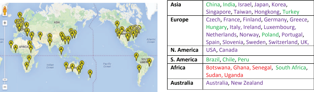
FIGURE 2. “A” signs in the map represent the citing locations, according to ISI Web of Knowledge . ([Exhibit 47]). Different colors in the right table represent developed , developing , and least developed countries.

As Figure 2 shows below, my articles have received citations from 40 countries in all 6 major continents , including developed and developing countries in Asia, Europe, North and South America, and Australia , as well as many least developed countries in Africa . Therefore, my articles clearly have global impact and international acclaim .